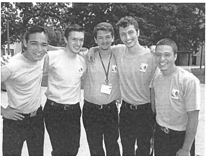
The HVRHS Envirothon team in Montana.