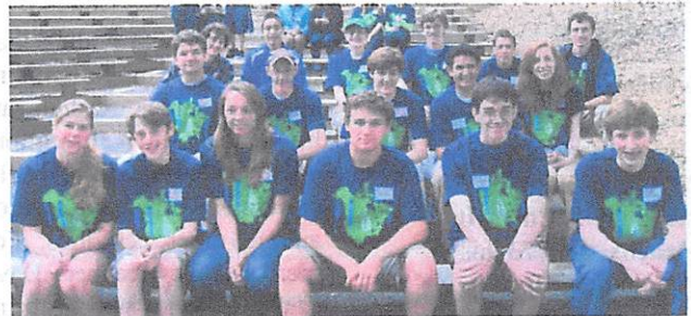
The Housatonic Envirothon Team at the 2012 Canon Envirothon held in Selinsgrove, Penn.